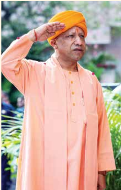
Uttar Pradesh Chief Minister Yogi Adityanath after hoisting the National Flag during the 79th Independence Day celebrations.