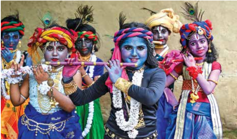
Young boys dressed up as Lord Krishna on the eve of the ‘Janmashtami’ festival in Nadia, West Bengal on Friday.

He also asked officials to ensure that bodies of deceased hailing from the state reach their native place in East Champaran.