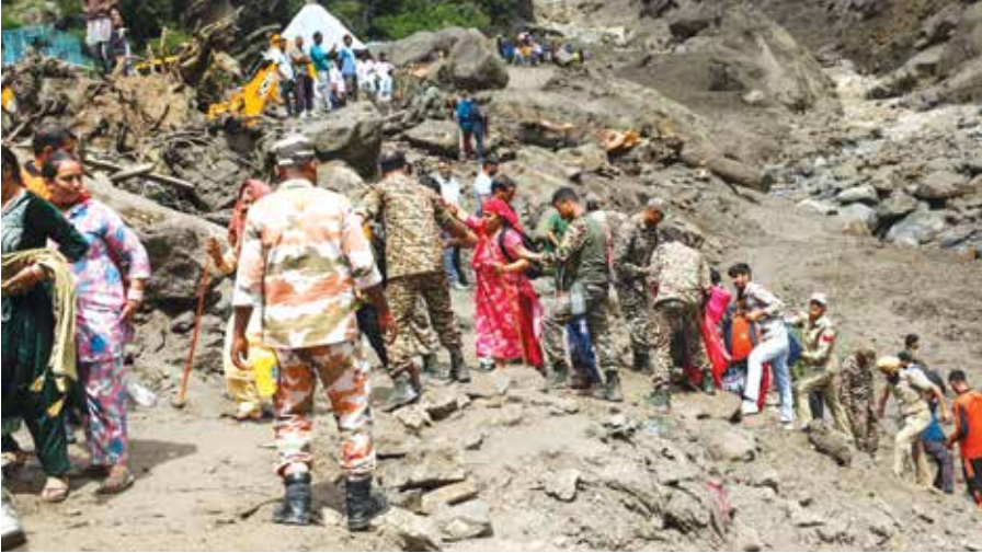
Rescue work underway at an affected area following a cloudburst in Kishtwar district Jammu and Kashmir on Friday.

“We stopped at a Maggi shop. People told us to run