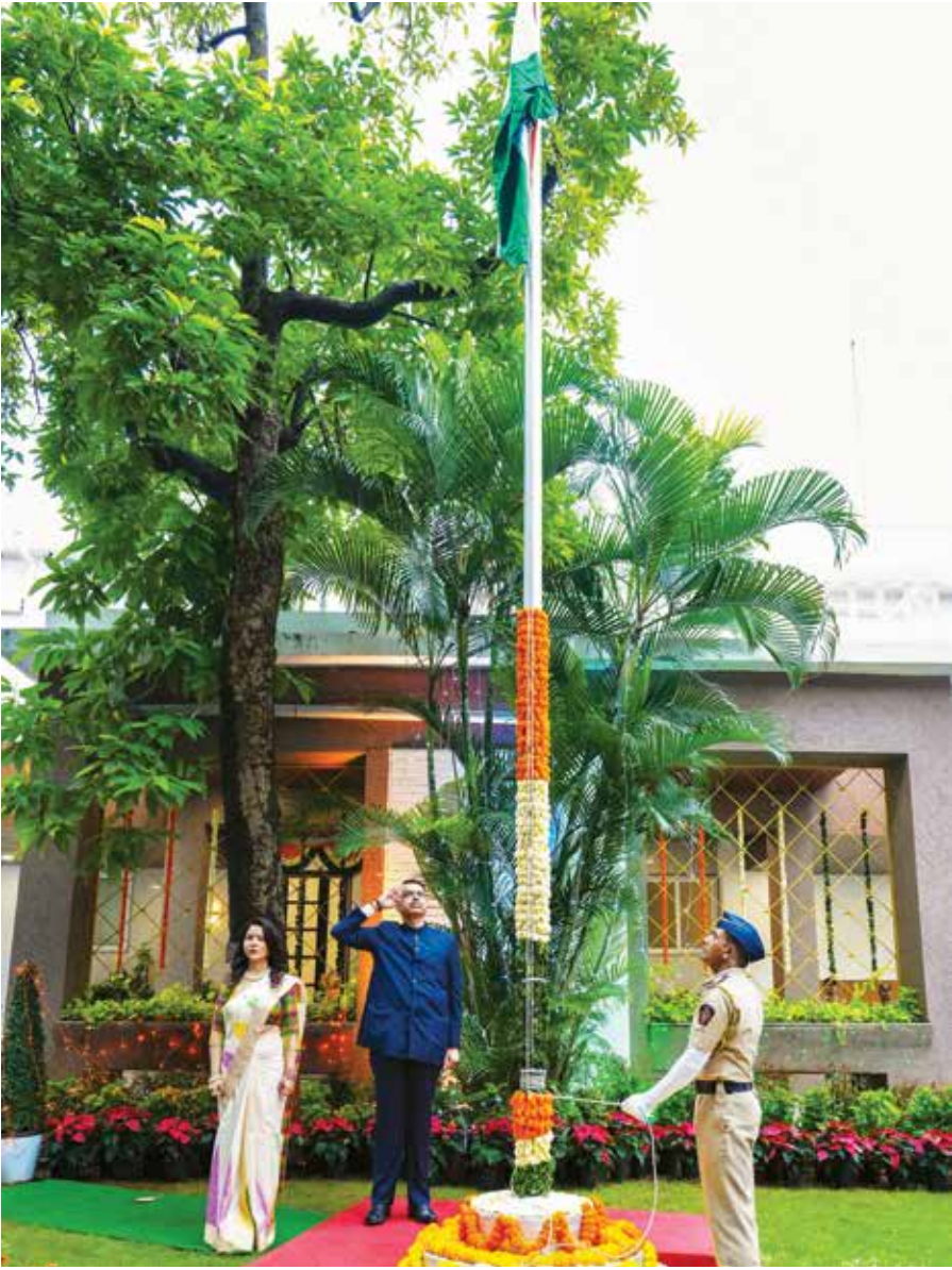
Maharashtra CM Devendra Fadnavis after hoisting the national flag during the 79th Independence Day celebration in Mumbai.