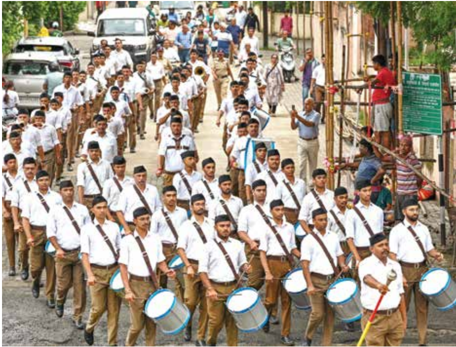
Rashtriya Swayamsevak Sangh volunteers take part in ‘Path Sanchalan’ on the occasion of the 79th Independence Day in Nagpur on Friday.