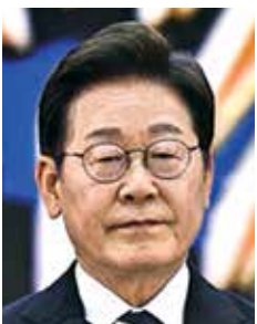
Lee Jae Myung, President, South Korea

“To prevent accidental clashes between South and North Korea and to build military trust, we will take proactive, gradual steps to restore the (2018) Sept 19 military agreement. The wealthier South will not pursue any form of unification.”