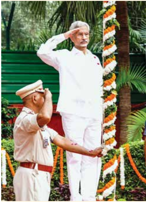
Delhi Chief Minister Rekha Gupta with Delhi Police personnel during the 79th Independence Day celebration, amid rain, at Chhatrasal Stadium in New Delhi.