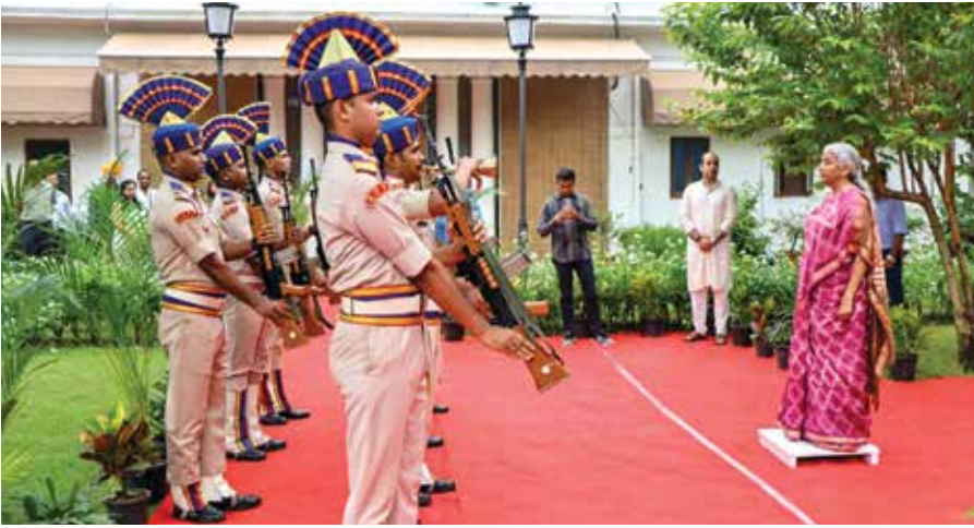
Finance Minister Nirmala Sitharaman inspects the Guard of Honour during the 79th Independence Day celebration in New Delhi.

Jalan said a lower GST rate will augur well for the overall economy. -PTI