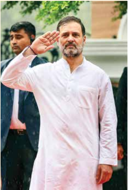
LoP in the Lok Sabha and Congress leader Rahul Gandhi during the 79th Independence Day celebration in New Delhi.