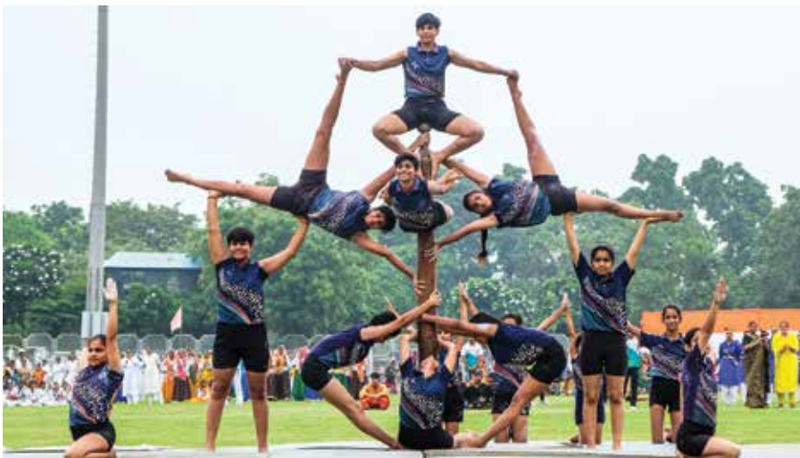
Students perform 'Mallakhamb' during the 79th Independence Day celebration in Gurugram on Friday.