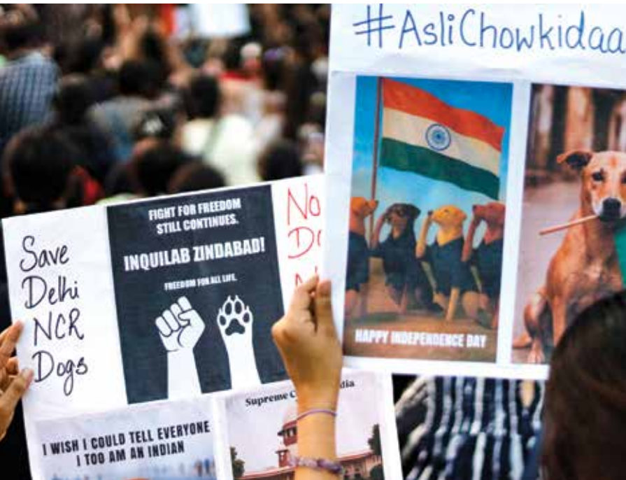
Animal lovers hold placards during a protest in solidarity with stray dogs at Nehru Park in New Delhi on Friday.