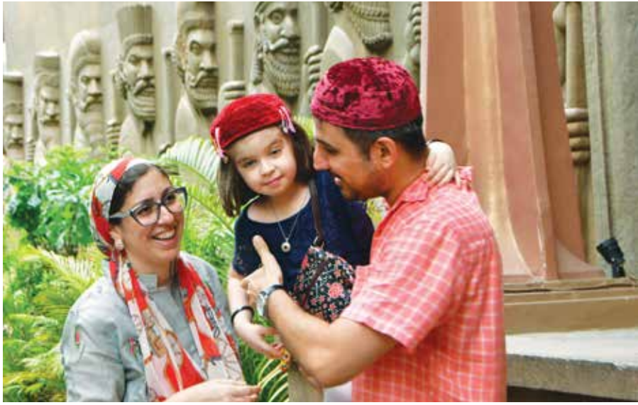
A Parsi family at a Fire Temple on the occasion of Parsi New Year at Tardeo in Mumbai on Friday.