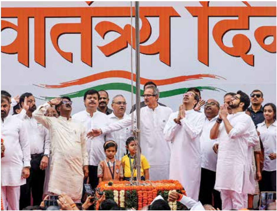
Shiv Sena (UBT) chief Uddhav Thackeray, son Aaditya and others during the hoisting of the national flag at Shiv Sena Bhavan in Mumbai on Friday.

"Let anyone try to stop us, no matter whose descendants they are. We will ensure Marathas get sustainable reservation under the OBC category. On August 29, we will march to Mumbai and return only after securing it. The upcoming protest would be five times bigger than the previous one," he claimed. "Community members must not stay home. This is the final fight," he said while asserting he is determined to continue the agitation despite health issues from his continuous tours and meetings. The August 29 stir will be decisive and would ensure victory for the Maratha community, Jarange added.