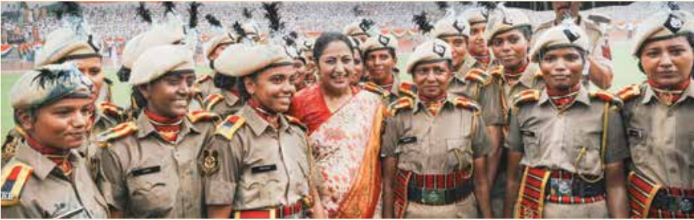
Delhi Chief Minister Rekha Gupta with Delhi Police personnel during the 79th Independence Day celebration, amid rain, at Chhatrasal Stadium in New Delhi.