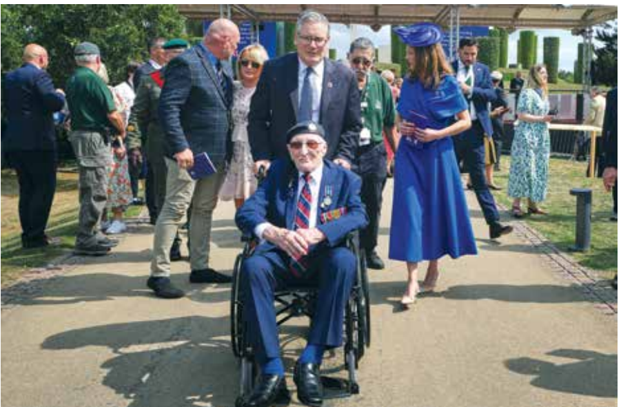
Britain's Prime Minister Keir Starmer pushes a veteran in a wheelchair during the 80th Anniversary of VJ Day in Alrewas, England on Friday.