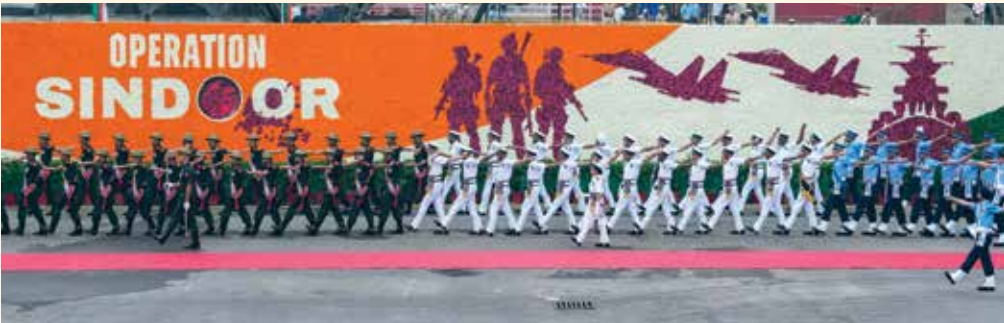
Armed forces personnel during the 79th Independence Day celebration at the Red Fort in New Delhi on Friday.