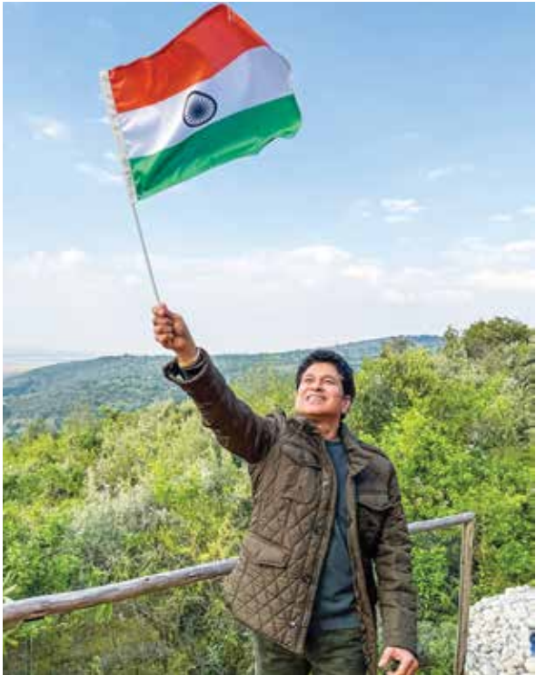
Former Indian cricketer Sachin Tendulkar holds the national flag during the 79th Independence Day celebration.