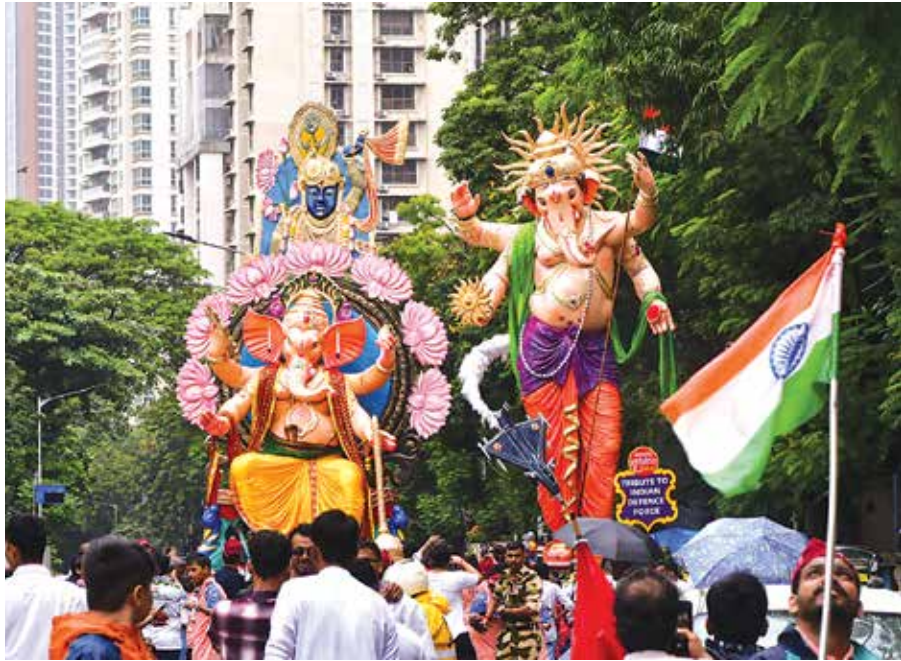
People carry idols of Lord Ganesha ahead of the 'Ganesh Chaturthi' festival in Mumbai on Friday.