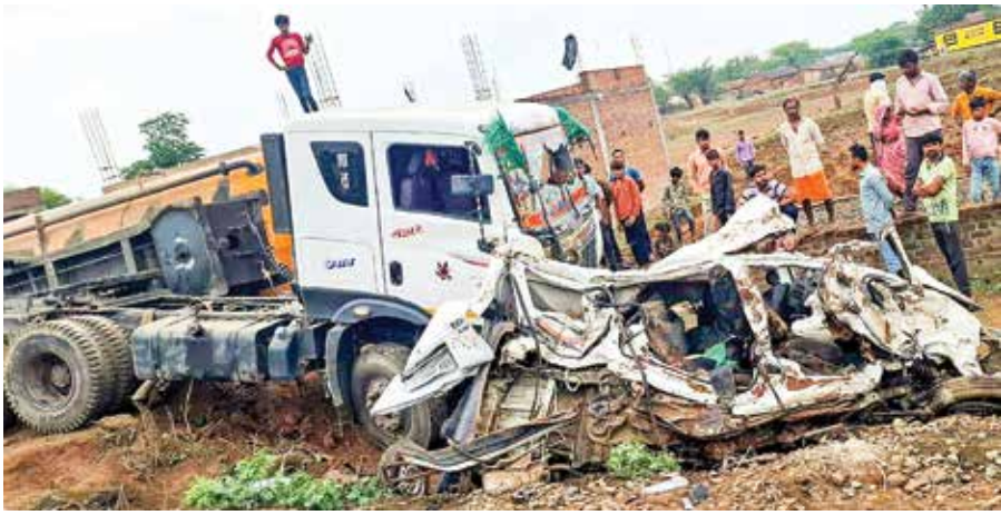
People gather at the accident site after a truck carrying cement overturned on a van killing at least nine members of a family, in Thandla, Jhabua district on Wednesday.