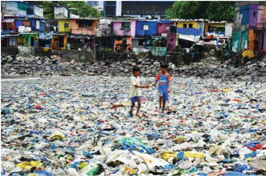
Kids walk through tonnes of plastic waste near Badhwar Park, in Mumbai on Wednesday.

All passengers were safely evacuated after the incident, which occurred when the bus at Marol bus depot on MIDC Road, they said. Citing preliminary information, an official said that an electric bus of NMMT plying on the Route 144, between Airoli in Navi Mumbai and Andheri in Mumbai, caught fire around 6 pm. Two fire engines of the Mumbai fire brigade were rushed to the spot, and the blaze was doused within a few minutes, he said.