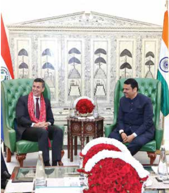
CM Devendra Fadnavis with President of Paraguay Santiago Peña in Mumbai.

The Vitthal Rukmini temple is one of the most revered pilgrimage sites in the state, drawing nearly two crore devotees annually, including during the two major wari pilgrimages.