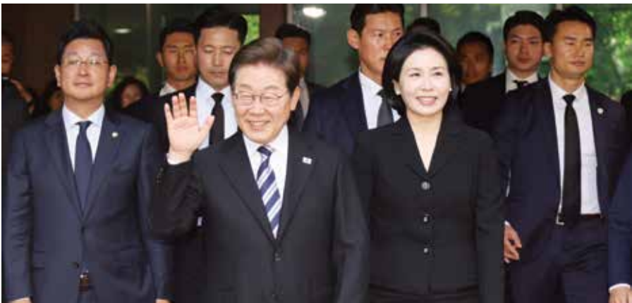
South Korea's newly elected President Lee Jae-myung, center left, and his wife Kim Hea Kyung leave their house in Incheon, South Korea on Wednesday.

"Through pragmatic diplomacy based on national interests, we will turn the