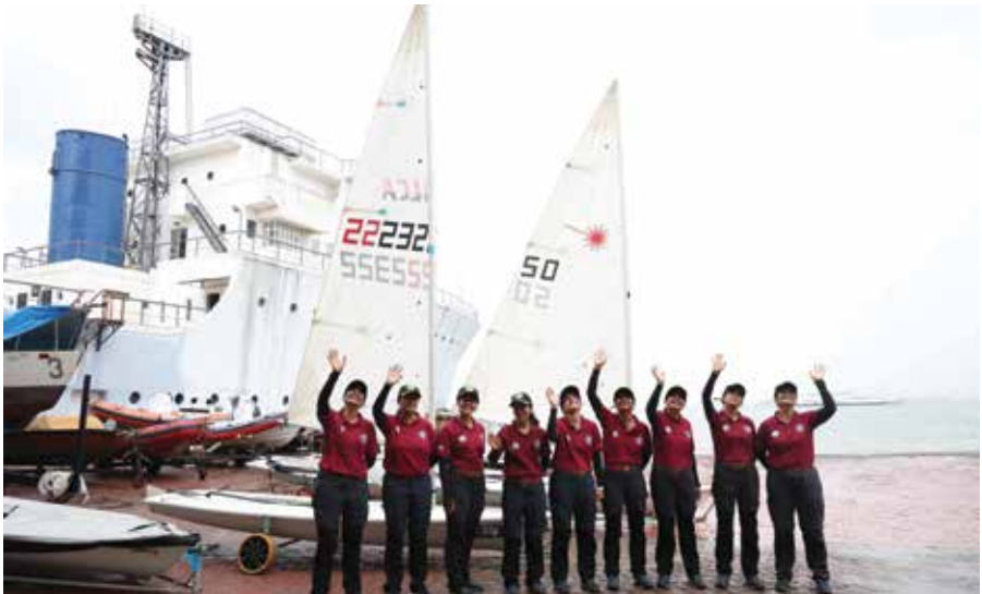
Members of the tri-services team that carried out the 'Samudra Pradakshina', an all-women sailing expedition from Mumbai to Seychelles and back, during the team's flagging-in ceremony, in Mumbai on Wednesday.