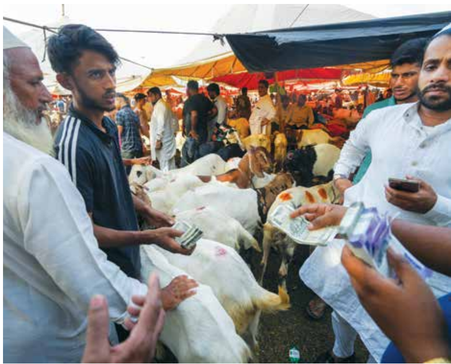
Goats being sold at a market ahead of the Eid-ul-Adha festival, in New Delhi on Wednesday. Pic: PTI