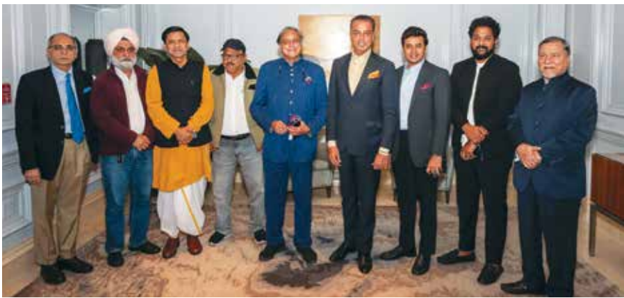
Members of the all-party delegation led by Congress MP Shashi Tharoor upon their arrival in Washington D.C.