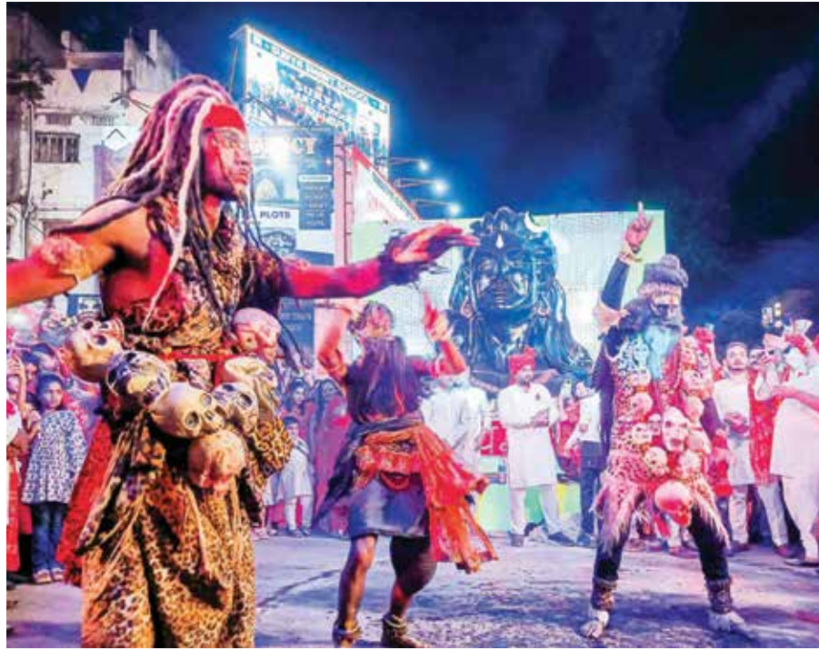
People during Mahesh Navami celebration, at Jagdalpur in Bastar district on Wednesday.

Gujarat logs 119 new COVID-19 cases Ahmedabad: As many as 119 new COVID-19 cases were detected in Gujarat, taking the active tally to 508, while no fresh death linked to the infection was reported, said the state health department on Wednesday. The total count of active COVID-19 cases stood at 508 with the registration of 119 new infections during the last 24 hours. Of these, 18 patients are hospitalised, while 490 others are receiving treatment in home isolation, said a department release. No new death linked to the infection was reported during this period, it said. The department said 72 patients have been discharged so far following recovery from the viral infection, whose cases have spiked in the last few weeks. So far, one death has been reported due to COVID-19 in Gujarat after a fresh wave has hit the country. The Ahmedabad Municipal Corporation has confirmed an 18-year-old woman succumbed to the infection at civic-run LG Hospital on Monday. According to the health department, all the coronavirus cases emerging in Gujarat are of JN.1, LF.7, LF.7.9 and XF.6 variants of the Omicron family, which cause mild fever and cough. There was no need to panic as COVID-19 cases usually see a “rising trend” every 6 or 8 months, it added in the release.