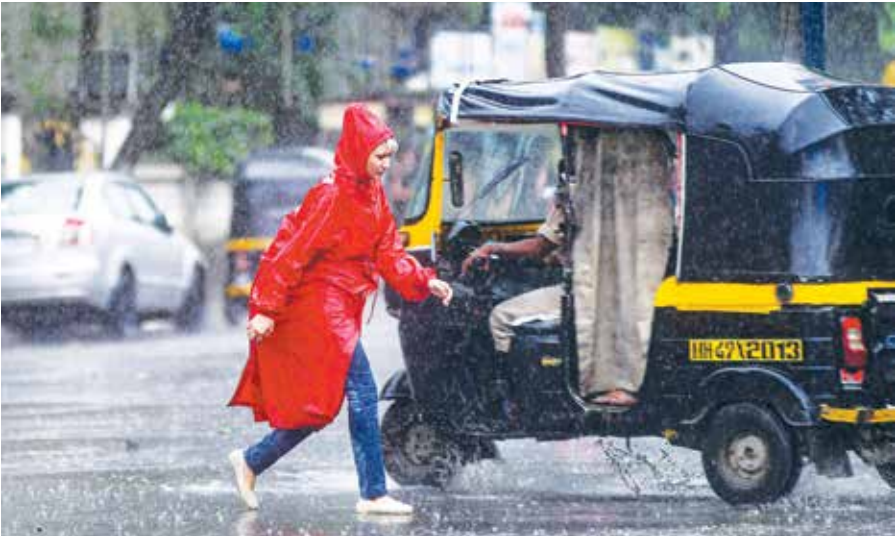
A commuter crosses a road amid rainfall, in Mumbai on Wednesday.