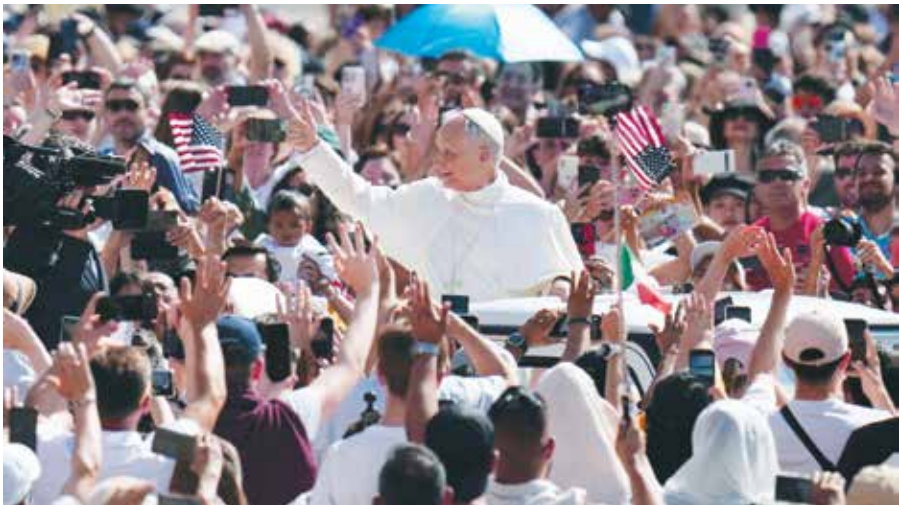
Pope Leo XIV waves as he arrives for his weekly general audience in St. Peter's Square at The Vatican on Wednesday.