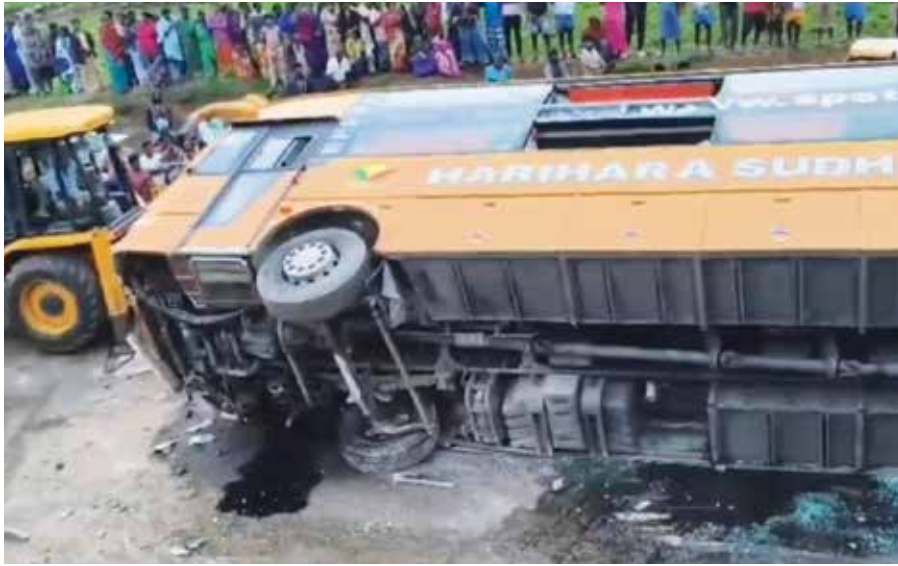
Private bus travelling from Madurai to Bengaluru overturns in Hosur, Tamil Nadu on Tuesday.