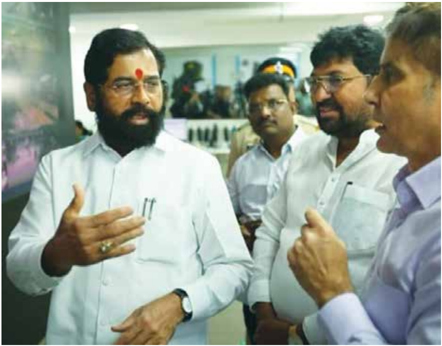
Deputy Chief Minister Eknath Shinde inspects the BMC control room after torrential rains in the city on Tuesday.