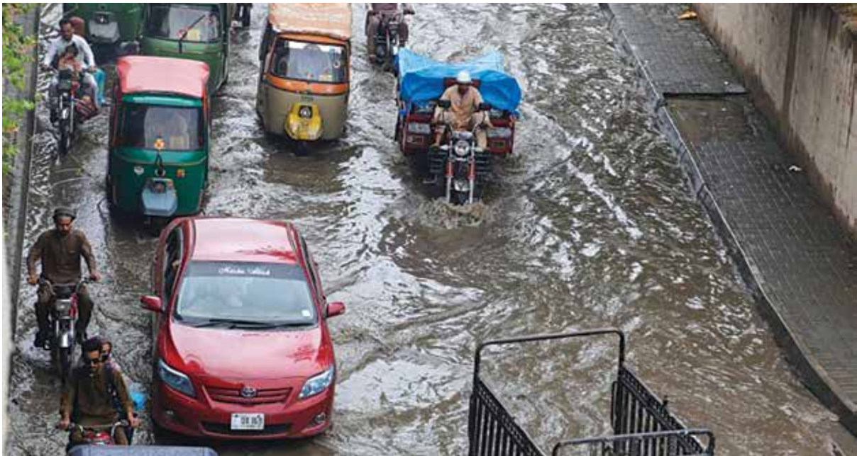
Vehicles and motorcyclists drive through a flooded road after heavy rainfall in Peshawar in Pakistan on Monday.

Ushakov said they also discussed "the idea of raising the level of the direct Russian-Ukrainian negotiations." Zelenskyy told reporters following the White House meeting that if Russia does "not demonstrate a will to meet, then we will ask the United States to act accordingly." NATO Secretary General Mark Rutte said in an appearance on Fox News that "if Russia is not playing ball" on direct talks with Ukraine, "the United States plus Europe will do more when it comes to tariffs and sanctions" on Moscow.