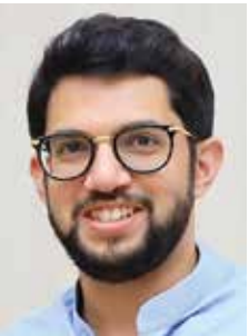
Aaditya Thackeray, MLA, Shiv Sena (UBT)

"Mumbai, Thane, Kalyan Dombivali, Vasai-Virar are seeing an absolute collapse of governance. Instead of doing photo ops the Ministers should have ensured that Municipal Corporations are ready to tackle the heavy rains."