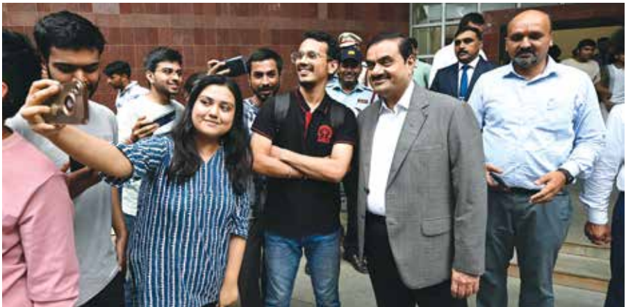
Adani Group chairman Gautam Adani interacts with youth at Platinum Jubilee Session of IIT Kharagpur on Monday.

New Delhi: China's export restriction on key rare earth magnets has resulted in a supply chain bottleneck and impacted domestic industries, including electric vehicle manufacturers, Parliament was informed on Tuesday. In a written reply to the Lok Sabha, Minister of State for Commerce and Industry Jitin Prasada said consultations have been held regularly with relevant stakeholders to explore measures to address the issue. He also said that Ministry of Mines has been working to ensure supply chain resilience for critical minerals, including rare earth elements, which are used in producing rare earth magnets, as they are key materials for different sectors including EVs. To develop cooperation with countries having rich mineral resources, the mines ministry has already entered into bilateral agreements with governments of Australia, Argentina, Zambia, Peru, Zimbabwe, Mozambique, Malawi, Cote D'Ivoire and international organizations such as International Energy Agency (IEA). "The recent imposition of export restrictions on key rare earth magnets by China has resulted in a supply chain bottleneck, impacting the Indian industries including electric vehicle manufacturers," he said. Further, Khanij Bidesh India Limited (KABIL), is engaged in this area by developing collaboration with various organisations based in different countries.