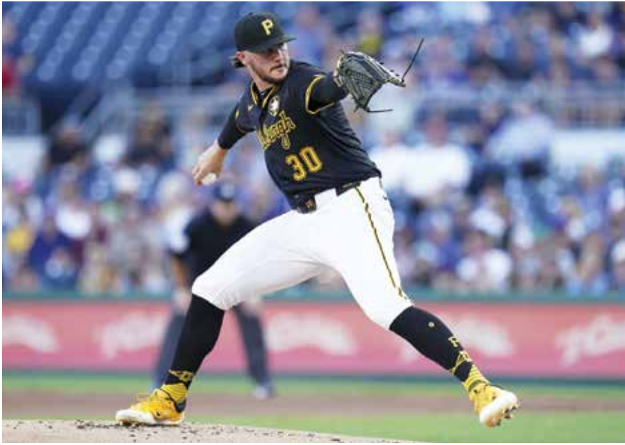
Pittsburgh Pirates pitcher Paul Skenes during a baseball match against Toronto Blue Jays.

The Act also gives the central government discretionary power to limit India's international participation in "extraordinary circumstances" and where "national interest" is at stake. -PTI