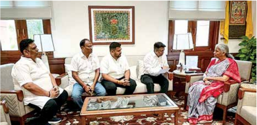
BJP MP Dhaval Patel calls on Union Finance Minister Nirmala Sitharaman at Parliament House in New Delhi.

addressing immediate challenges while implementing long-term structural reforms. For short-term stability, the committee observes that the government's strategy such as maintaining buffer stocks; regulating market supplies; and subsidising key food items helps to stabilise food prices and ensure affordable access to essential commodities," the report said. To further enhance agricultural productivity and foster financial inclusion, the committee recommended acceleration of digital initiatives. "This includes digitising land records and implementing the agri-stack, a technological framework designed to link farmers' produce with banking and credit systems. This would facilitate transparent and timely disbursement of crop loans," it said. The panel also urged that these digital tools be expanded nationwide, with local youth being trained to assist in data collection, thereby creating employment opportunities and improving data accuracy. -PTI