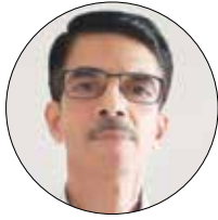
By Prasad Dixit

In India’s noisy democracy, civility has become a scarce commodity. The tone of debate—in television studios, press conferences and parliament itself—has coarsened beyond recognition. Those who recall earlier decades speak wistfully of an era when political opponents still treated one another with courtesy, and when the opposition, while critical, stood by the government at moments of national trial. In the early years after independence, Jawaharlal Nehru was known for treating his adversaries with respect. Indira Gandhi, during the 1971 war with Pakistan, received unflinching support from across the aisle, without bickering over numbers of casualties or costs. In 1991, when India’s economic model collapsed and the government was forced into radical liberalisation, opposition parties lent the minority Congress government crucial backing, refraining from opportunistic attacks. Even in the fractious 1990s, when instability was the norm, the rapport between P.V. Narasimha Rao and Atal Bihari Vajpayee was such that Rao nominated his rival Rather than indulging in what-aboutery, the opposition must show what responsible dissent looks like in a democracy.