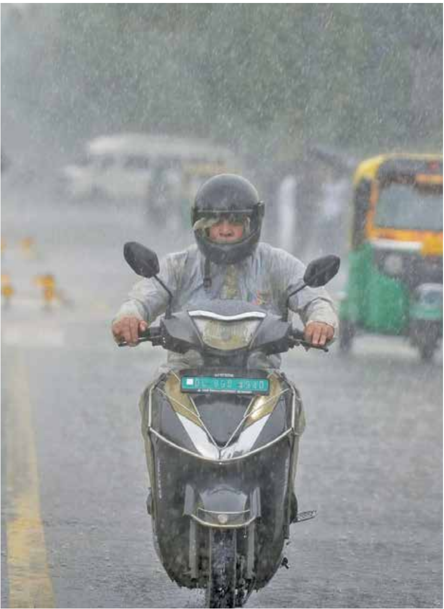
Rains lash out New Delhi on Tuesday.

Patna: During the ‘Voter Adhikar Yatra’ in Bihar on Tuesday, a policeman was injured in an incident involving a car carrying the leader of the Opposition, Rahul Gandhi. The open-top jeep ran over the officer’s feet on a crowded street filled with the politician’s supporters and security personnel in Nawada. Immediately, fellow policemen and supporters of Gandhi pushed the vehicle backwards to rescue the injured policeman. He was seen limping away after being freed from under the car’s wheels. Gandhi, who was standing in the open-top jeep, immediately took a water bottle and handed it to his supporters to assist the injured officer. He later approached the policeman to inquire about the nature of his injury. The BJP criticised the Congress party over the incident. Party spokesperson Shehzad Poonawala mocked the Congress march, calling it the “Crush Janta Yatra,” and stated, “Rahul Gandhi’s car crushed a police constable, who was critically injured. The dynast did not even get down to check on him.”