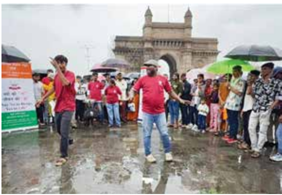
75-80 Customs Officers. Students educated NCB staff interacted with

awareness and spreading knowledge about the consequences of drug abuse and trafficking. The key programmes included: Training Officers A detailed training session on the provisions of the NDPS Act, relevant judgments and case studies was conducted at Mumbai International Airport for Officers of Mumbai Customs. The session was addressed by the Additional Director and Superintendent of NCB Mumbai and was attended by approximately