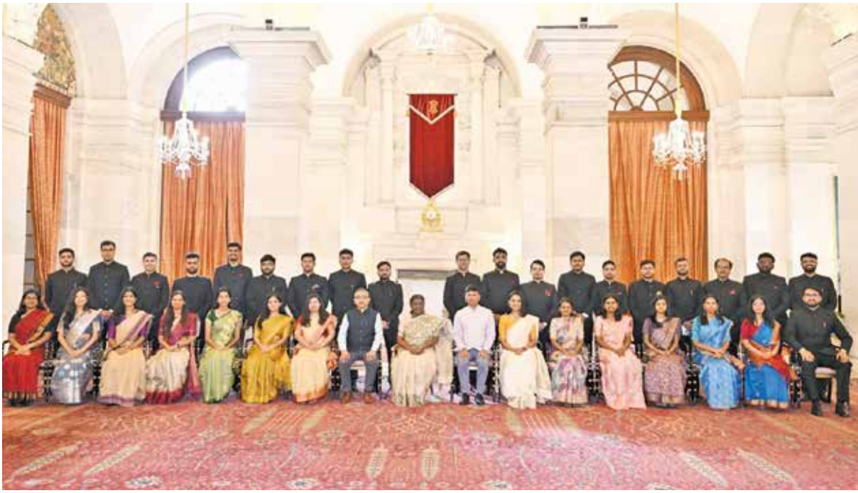
Officer Trainees of the Indian Foreign Service called on President Droupadi Murmu at Rashtrapati Bhavan in New Delhi on Tuesday.

“The situation is under control as of now,” he added. The Old Railway Bridge in Delhi, which serves as a key observation point for tracking the river’s flow and potential flood risks in the national capital, serves as a major observation point for Gautam Budh Nagar district as well. Officials of both Delhi and Gautam Budh Nagar district coordinate over this. Yamuna water level at Old Railway Bridge reached 205.79 metres, slightly short of the 206-metre evacuation level, at 8 am on Tuesday. The water level in the river had touched 205.55 metres on Monday afternoon, breaching the danger mark of 205.33 metres and has been increasing since then. According to the flood control department, currently the Hathnikund barrage is releasing around 38,361 cusecs of water and Wazirabad is releasing 68,230 cusecs every hour. -PTI