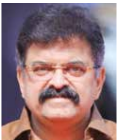
Jitendra Awhad, MLA, NCP (SP)

"How could 76 lakh votes increase (in the last hour of polling) in Maharashtra? I reiterate that the Assembly elections were managed. This government came to power by stealing votes. The EC won't accept allegations."