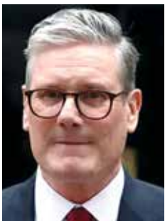
Keir Starmer, Prime Minister, Great Britain

"The path to peace in Ukraine cannot be decided without President Zelenskyy. I welcome the openness of the US, alongside Europe, to provide robust security guarantees to Ukraine as part of any deal."