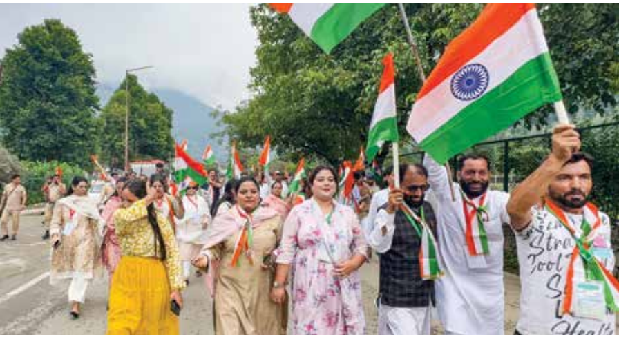
Muslim Rashtriya Manch (MRM) members take part in ‘Tiranga Yatra’ in Pahalgam on Sunday.