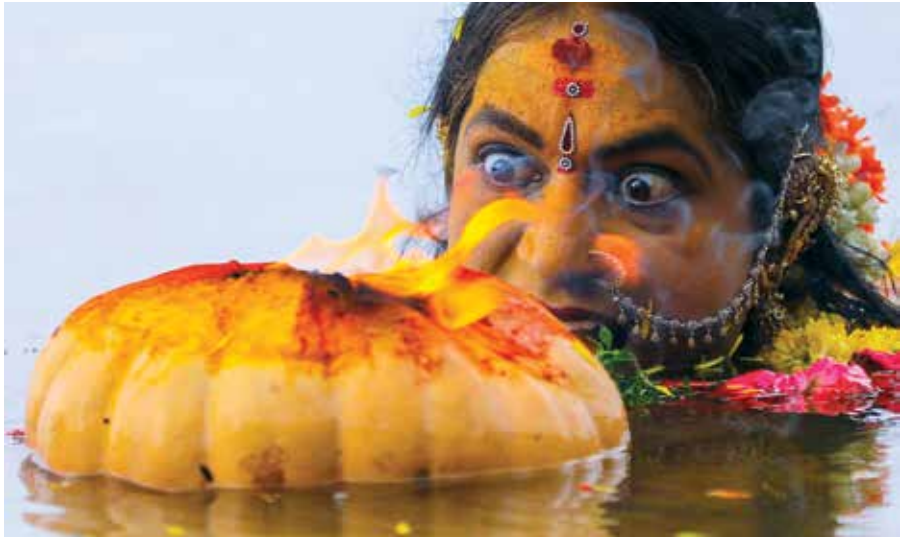
A transgender performs rituals at Hussain Sagar lake on the occasion of 'Ganga Teppotsavam' in Hyderabad on Sunday.

Supporters gathered at the launch event and chanted slogans against the EC and the BJP like "vote chor, gaddi chhor".