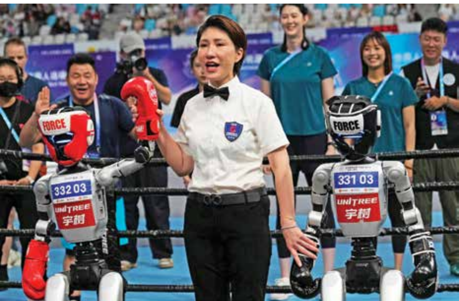
A referee announces the winner of a Free Combat event during the World Humanoid Robot Games held in Beijing, China.