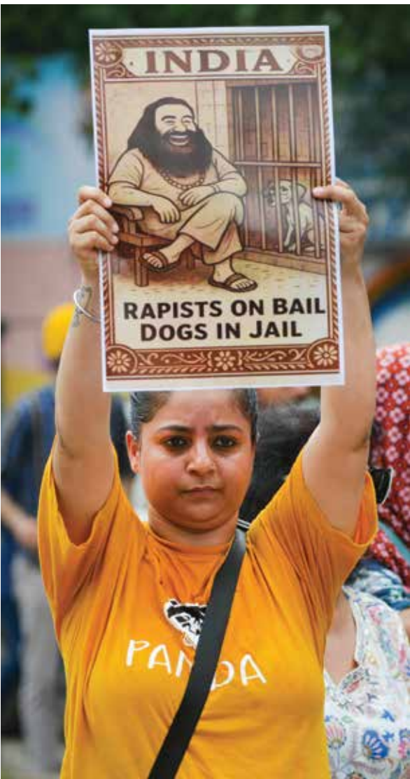
An animal lover holds a placard during a protest against the recent order by the Supreme Court to start picking up stray dogs from all localities and relocate them to dog shelters at Ramlila Maidan in New Delhi on Sunday.

entire episode has to be thoroughly investigated, which means the person who has given the complaint, the leftist groups and the forces which are working behind this propaganda need to be investigated,” he said. Asked about the BJP’s intention behind the visit, he said: “After the state government constituted the SIT or ever since the investigation started, crores and crores of devotees of this temple have been hurt due to propaganda. So our demand to the state government is to take this propaganda seriously, and a proper investigation has to be carried out. In this regard, we visited Dharmasthala.” He also clarified that the BJP “was not interested in politics from day one.” “Our stand is very clear. We have welcomed the state government’s decision to constitute the SIT. The only issue and the serious matter is that nobody can tolerate propaganda during the course of investigation,” he said. Countering the BJP, Deputy Chief Minister DK Shivakumar termed the visit as politically motivated. -PTI