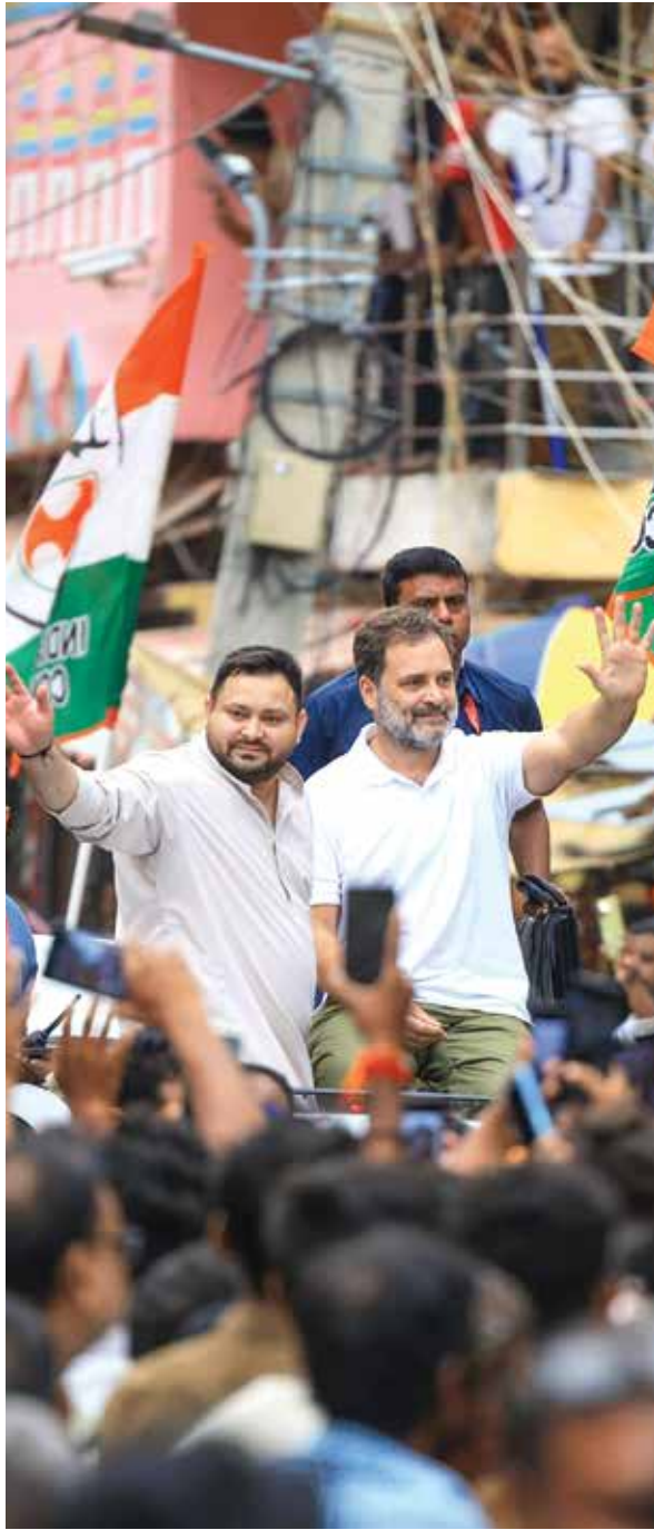
LoP in the Lok Sabha and Congress leader Rahul Gandhi with RJD leader Tejashwi Yadav during 'Voter Adhikar Yatra' in Sasaram.