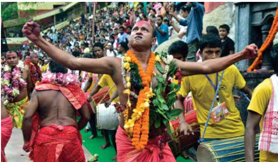
A Deodhani dancer performs during the annual 'Manasha Puja' at Kamakhya Temple in Guwahati on Sunday.

Shukla conducted over 60 experiments and 20 outreach sessions during the 18-day mission.