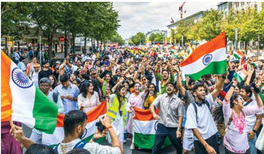
Members of the Indian community during 'Bharat Parade' organised to celebrate India's 79th Independence Day at Brandenburg Gaten in Berlin.