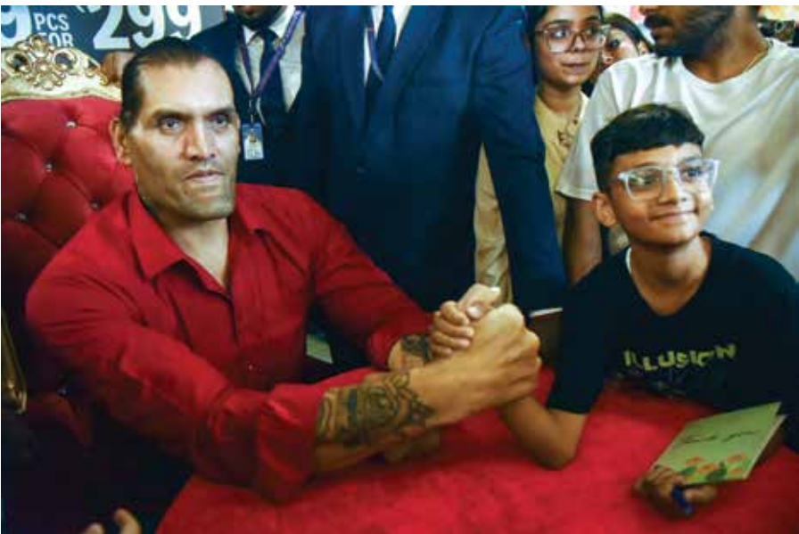
Former WWE wrestler Dalip Singh Rana, popularly known as The Great Khali, during an event at Connaught Place in New Delhi on Sunday.