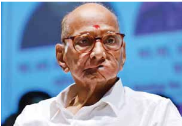
Pune: NCP (SP) president Sharad Pawar has said he led the move to topple the

Maharashtra government headed by Vasantdada Patil in 1978, but the same