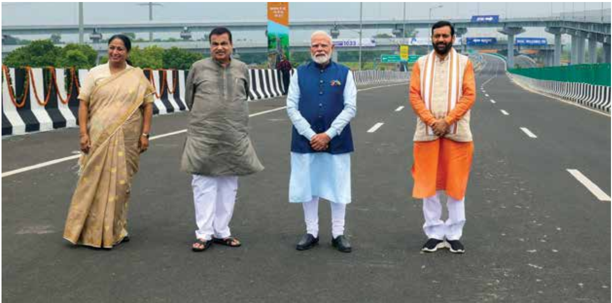
Narendra Modi with Union Minister Nitin Gadkari, Delhi Chief Minister Rekha Gupta and Haryana Chief Minister Nayab Saini during the inauguration of the Delhi section of the Dwarka Express.

After 16 days, the yatra will conclude with a rally in Patna on September 1.