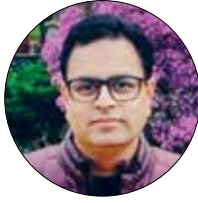
By Sumant Vidwans

Governments, aware of the dangers, issue advisories urging people to stay away from rivers or unstable slopes. Yet such warnings are of little use when communities depend on those very riverside roads, or when officials themselves sanction unsafe construction to court votes and revenue. Rescue operations are mounted after each calamity, but emergency teams find themselves cut off by the very landslides they are sent to manage. The irony is bitter. The mountains that supply India’s rivers, sustain its farms and beckon its holidaymakers are being steadily eroded by the twin pressures of a warming climate and human folly. The season that once replenished fields and filled reservoirs is now synonymous with funerals and collapsed homes. The economic losses run into billions each year, dwarfing the costs of prevention. India cannot halt the monsoon. But it can decide whether to keep meeting it with bulldozers and body bags, or with foresight. That means regulating construction in fragile zones, investing in slope stabilisation, and designing infrastructure to withstand the torrents that are no longer unusual but expected. It means recognising that ecological fragility is not a constraint on development but its precondition. Unless that lesson is learnt, the Himalayas will continue to tumble.