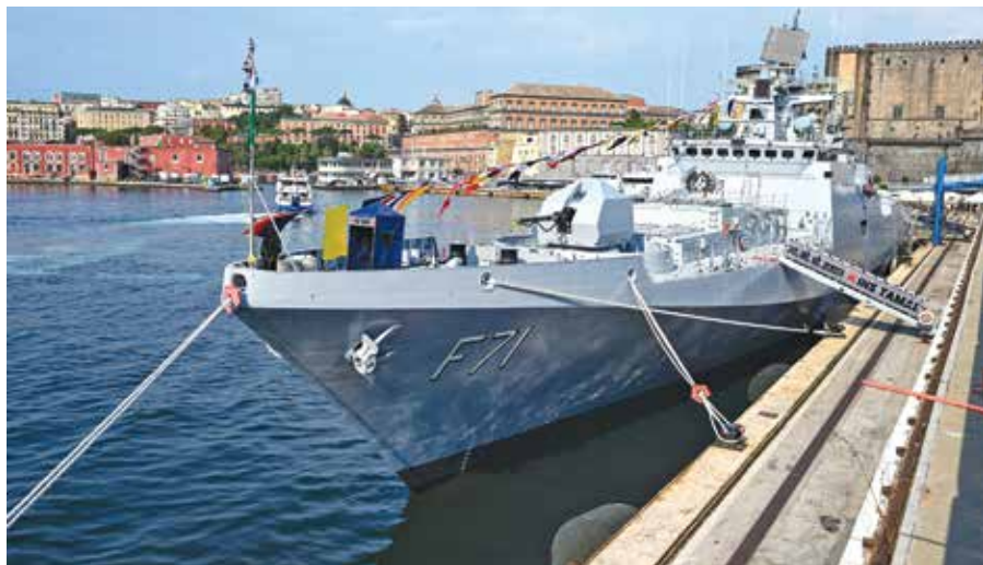
INS Tamal, the latest stealth frigate of the Indian Navy, called at Naples, Italy, from 13-16 August during her return passage to India.

Through the Act, the government removed imprisonment and/or fines in some provisions. Imprisonment was removed and fine was retained in a few rules, while in some cases imprisonment and fine were converted to a penalty. In his Independence Day speech on August 15, Prime Minister Narendra Modi said: "There are laws in our country, astonishing as it may sound, that provide for imprisonment over trivial matters, and no one ever paid attention to them". "I have taken it upon myself to ensure that such unnecessary laws, which place Indian citizens behind bars, are abolished. We had introduced a bill in Parliament earlier; we have brought it again this time," he noted. The government has earlier abolished more than 40,000 unnecessary compliances. It has also scrapped over 1,500 obsolete laws. "We have gone to Parliament to amend dozens of laws to simplify them, always placing the interests of the public first," Modi said. -PTI