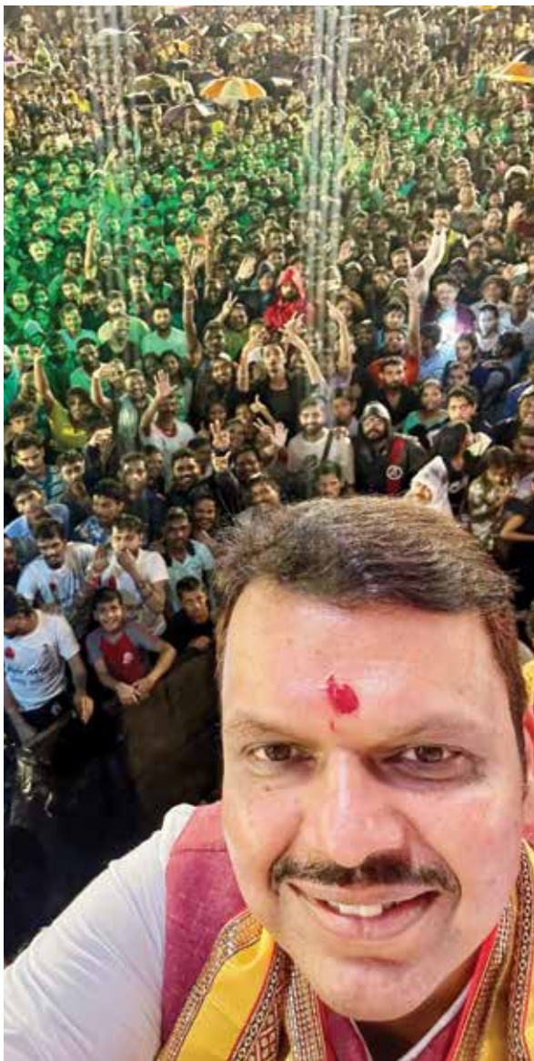
Chief Minister Devendra Fadnavis takes a selfie with Govindas during a 'Dahi Handi' event on the occasion of Janmashtami in Mumbai.