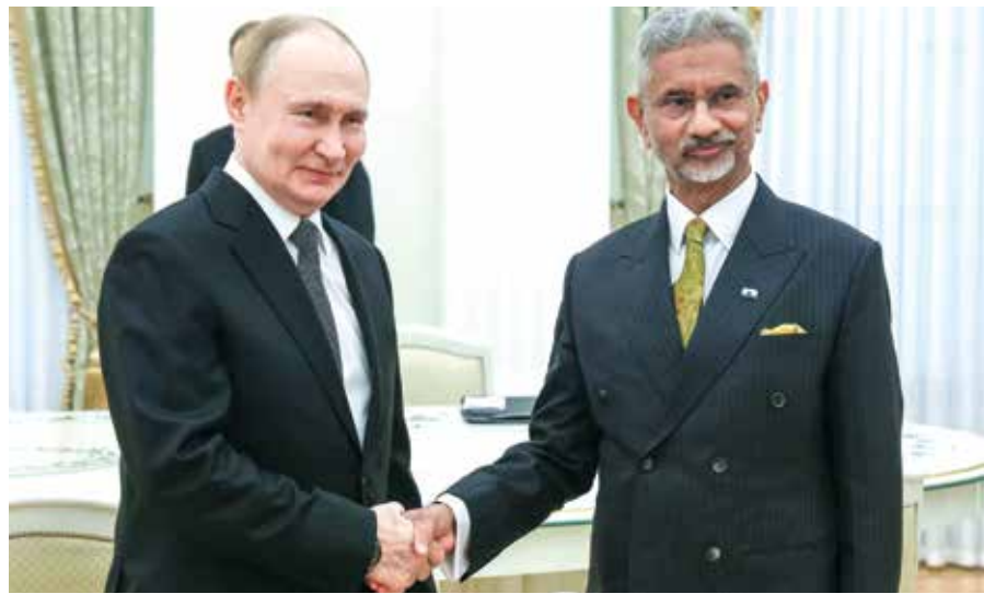
Russian President Vladimir Putin (left) and Indian Foreign Minister Subrahmanyam Jaishankar shake hands during their meeting in Moscow, Russia on Thursday.

The International Olympiad on Astronomy and Astrophysics, established in 2007, is one of the premier global platforms for high-school students passionate about astronomy and astrophysics.