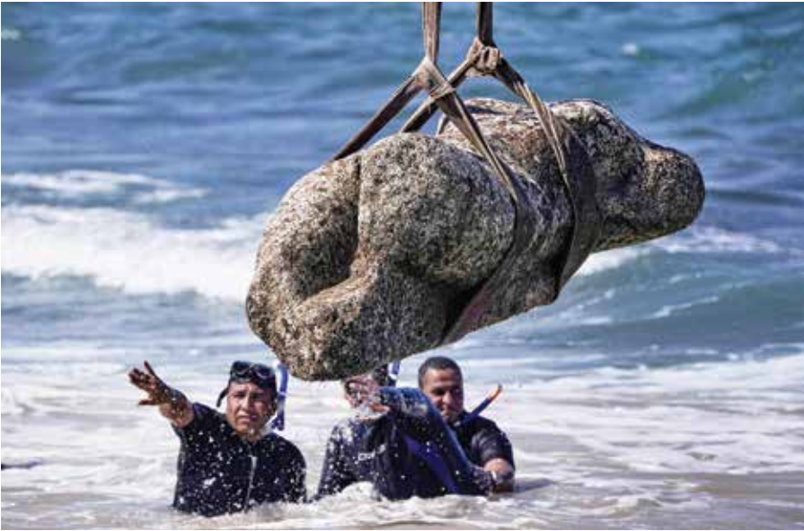
Divers monitor one of the ancient artifacts, unknown headless statue, as it is lifted out of the water in Abu Qir Bay at the Mediterranean city of Alexandria in Egypt on Thursday.