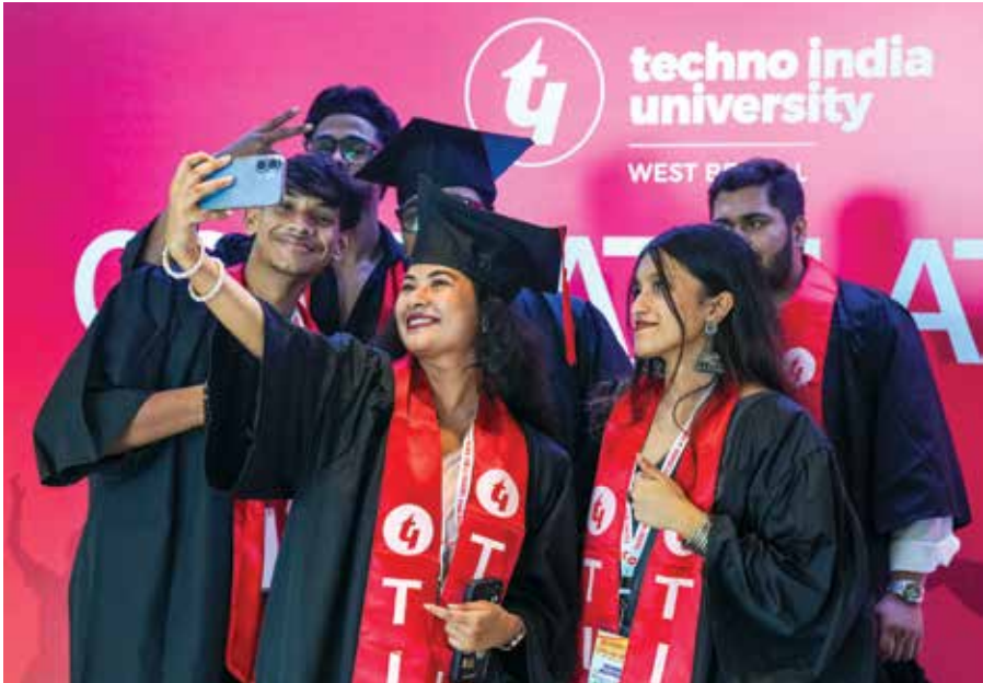
Students during Techno India University's Convocation 2025, at Biswa Bangla Convention Centre in Kolkata on Wednesday.

According to the Guidelines for Prevention of Misleading Advertisements and Endorsements 2022, disclaimers cannot contradict main claims or conceal material information. The CCPA said Rapido's advertisements violated these requirements by omitting key limitations without equal prominence. Rapido operates in over 120 cities and ran the misleading campaign for approximately 548 days in multiple regional languages. -PTI