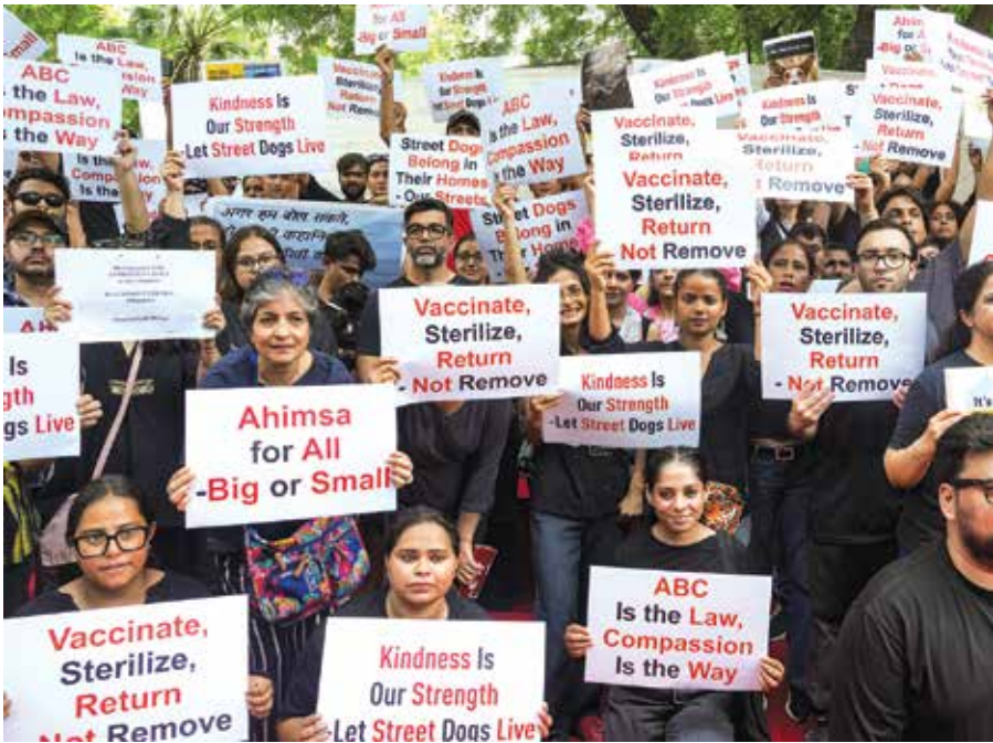
Animal lovers protest against the SC order directing authorities in Delhi-NCR to start relocating stray dogs from streets to shelters, at Jantar Mantar in New Delhi on Thursday.