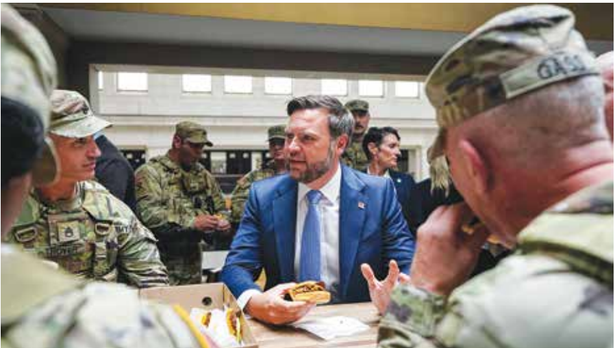
Vice President JD Vance eats a Shake Shack hamburger as he meets with members of the National Guard at Union Station in Washington on Wednesday.