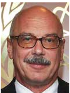
Vladimir Voronkov, Head, UN Office of Counter-Terrorism

"The UN has seen a resurgence of activity by the IS in the Sahel and in West Africa the group has emerged as a prolific producer of terrorist propaganda and attracted foreign terrorist fighters."