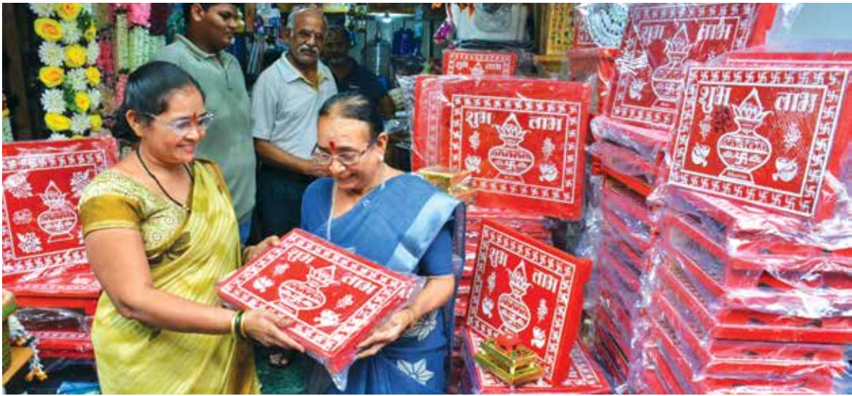
Women shop for various items during preparation ahead of the 'Ganesh Chaturthi' festival in Thane on Wednesday.

In Asian markets, South Korea's Kospi and Shanghai's SSE Composite index settled in positive territory, while Japan's Nikkei 225 index and Hong Kong's Hang Seng ended lower. Markets in Europe were trading in negative territory.