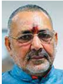
Giriraj Singh, Union Minister, Textiles

"Need to scale up India's handloom and handicraft exports. Efforts are underway to raise the monthly income of women artisans to at least Rs 15,000-20,000 per month. Around one crore people in India are engaged in the handloom and handicraft sector."