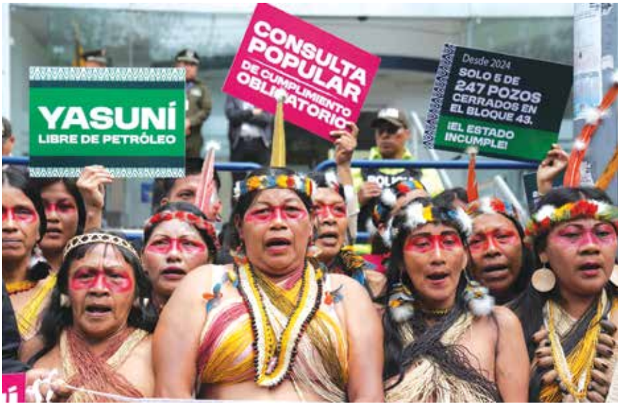
Waoarani Indigenous people lead a demonstration outside the Constitutional Court in Quito in Ecuador on Wednesday.