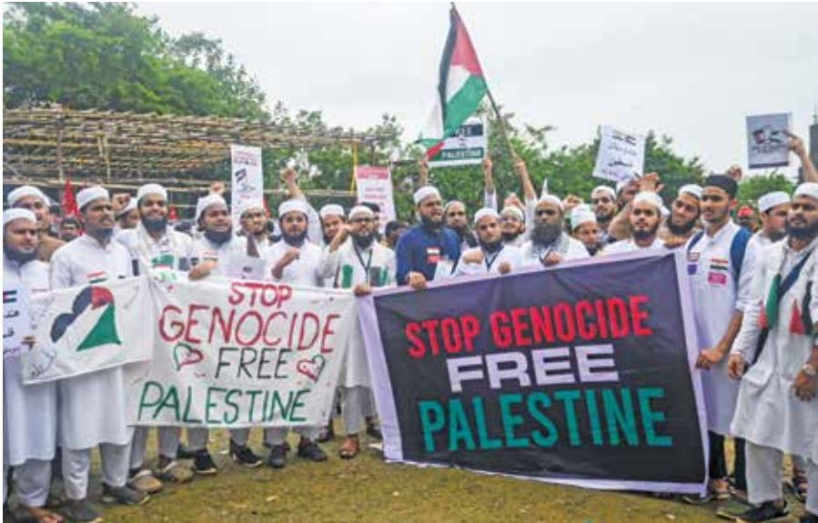
People stage a protest in solidarity with the people of Palestine in Mumbai on Wednesday.

On the Dharavi revamp project, Raj took a potshot at the Bharatiya Janata Party, saying: "Merely giving away the land to Adani Group will not help. Instead of getting worked up about 'Urban Naxals', address the fundamental urban issues in the city."