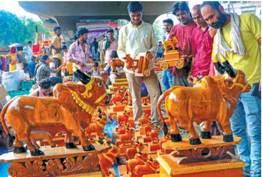
People look at wooden models of 'Nandi', the sacred bull of Lord Shiva ahead of the 'Pola' festival, in Nagpur on Thursday.

"However, while sending the summons by correspondence, we sent it in the name of Akshay Kumar to his address. We are also filing an application in the court to rectify the name," he said.