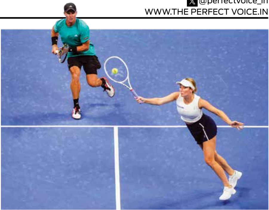
Danielle Collins plays with Christian Harrison during the mixed doubles semi final at the U.S. Open tennis championships on Wednesday.