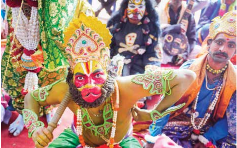
Members of Nomadic community during a protest over the report of Justice HN Nagamohan Das Commission on internal reservation for Scheduled Castes in Karnataka on Thursday.

Among the Bills introduced were the three seeking the removal of the prime minister, chief ministers and ministers arrested for 30 days on serious criminal charges, which were introduced on Wednesday by Home Minister Amit Shah.