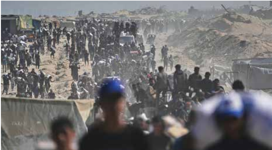
Palestinians carry sacks of flour unloaded from a humanitarian aid convoy on the outskirts of Beit Lahiya in northern Gaza Strip on Saturday.

A day later, Lyle Menendez told the parole board details about the abuse he suffered under his parents. He cried, face reddened, while delivering his closing statement. He seemed to still want to protect his “baby brother,” telling commissioners he took sole responsibility for the murders.