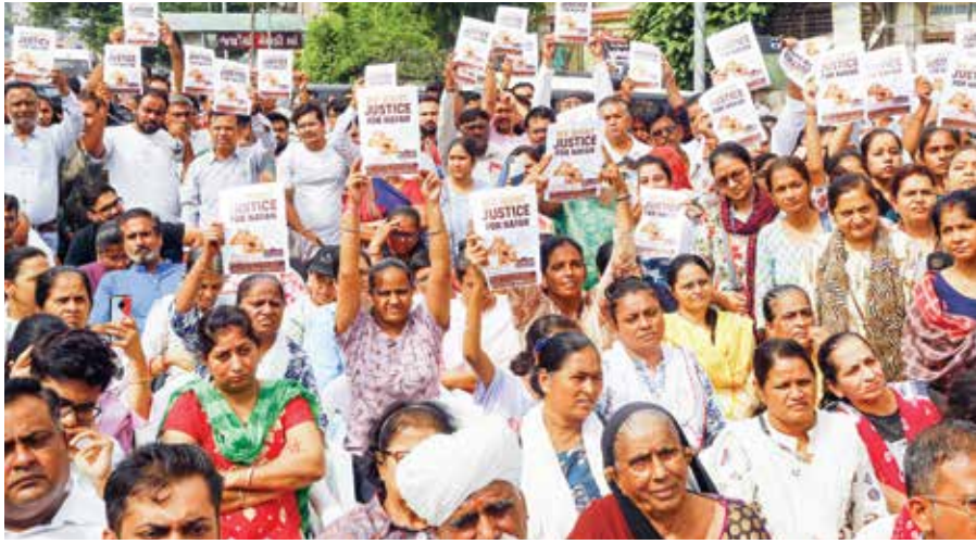
Parents of Seventh Day Adventist School students hold placards during a protest after a class 10 student of the school was recently stabbed to death in Ahmedabad.