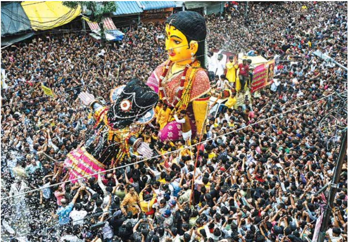
People participate in the 'Kali and Pili Marbat' procession as part of Pola festival celebrations in Nagpur, Maharashtra on Saturday.

If the people of Kolhapur do not demand their rightful share, they will continue to be left waiting—on the platform, watching development speed past them.