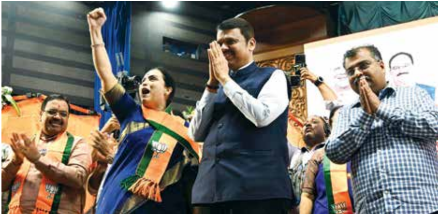
CM Devendra Fadnavis at a BJP function in Dadar on Saturday.

The pandemic briefly reinforced this trend as work-from-home boosted demand for bigger apartments. However, with affordability becoming the central theme of housing in MMR once again, 1BHKs are reclaiming their importance. They are no longer seen merely as entry-level accommodations but as practical, investment-worthy assets.