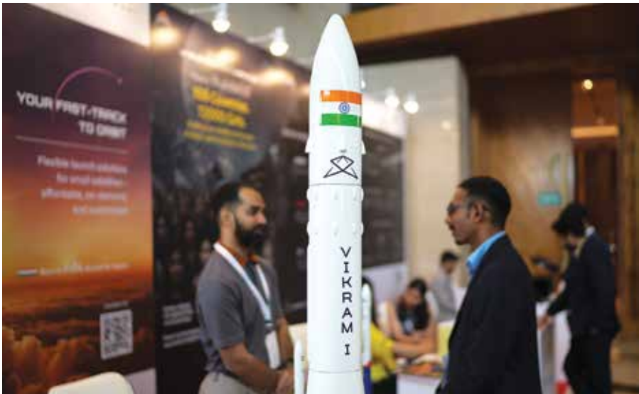
Visitors at a stall during the unveiling of first look of the Bharatiya Antriksh Station (BAS) on the occasion of the National Space Day, at Bharat Mandapam in New Delhi on Saturday.

Following the inquest, the body was shifted to Ernakulam Government Medical College.