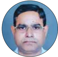
By Akhilesh Sinha

Energy has always been the invisible current of civilisation, powering economies and shaping empires. Today, its most visible form is crude oil, not just a tradable commodity, but the fulcrum on which global politics, economic stability and power balances rest. On this fulcrum, India has become indispensable. It is both a colossal consumer, sustaining the needs of 1.4bn people, and the world's fastest-growing major economy. That dual role makes one question unavoidable: what if India stopped buying Russian oil? The answer is more than a matter of statistics. It is a test of the stability of the global energy order. This balance has been continuously challenged by U.S. President Donald Trump. His tariff policy unwittingly recalls the cruel ploys of a predatory usurer in a village where prosperous farmers arranged for canal water to reach the fields of marginal farmers to ensure prosperity for the whole village. The greedy usurer despised this and, under cover of