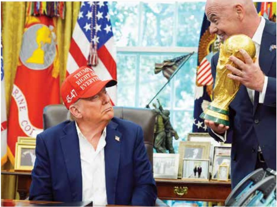
FIFA President Gianni Infantino, right, prepares to hand the FIFA World Cup Winners Trophy to President Donald Trump during an announcement in the Oval Office.

The Indian team totalled 629.5 to finish behind China 2 (632.3) and China 1 (630).