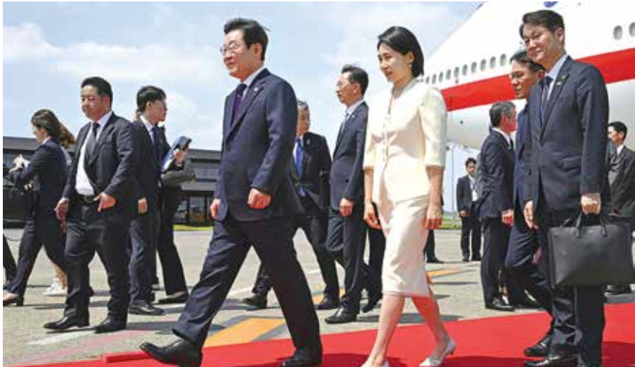
South Korean President Lee Jae Myung, center left, and his wife Kim Hea Kyung, center right, arrive at the Haneda airport in Tokyo, Japan on Saturday.