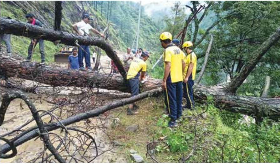
SDRF personnel and others remove a fallen tree at a disaster-hit area after heavy rainfall, at Tharali, in Chamoli district in Uttarakhand on Saturday.