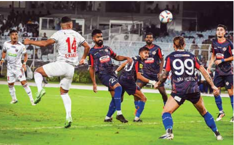
Players of NorthEast United FC (in white) and Diamond Harbour FC vie for the ball during the Durand Cup 2025 final match in Kolkata on Saturday.