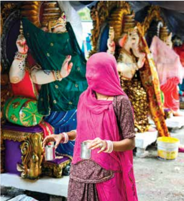
A woman sells idols of Lord Ganesha ahead of the 'Ganesh Chaturthi' festival at Mayur Vihar area in New Delhi on Saturday.