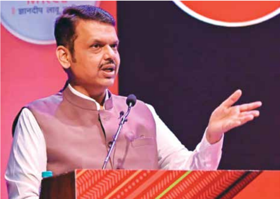
Chief Minister Devendra Fadnavis addresses a gathering during the inauguration of 'Symbiosis Artificial Intelligence Institute (SAII)' in Pune on Wednesday.

Mumbai: In light of Prime Minister Narendra Modi’s recent Independence Day assurance that GST reforms will be implemented by Diwali 2025, the Indian business community wrote to Finance Minister Nirmala Sitharaman. It highlighted the challenges the community faces. Multiple Registrations: Separate state-wise GST registrations increase compliance burden and cost. Blocked Working Capital: Surplus ITC in one state cannot be used to pay liabilities in another, forcing unnecessary cash outflows. Idle Taxpayer Funds: Credit balances remain locked, without flexibility to offset other Government dues. What it wants is the following: One Nation, One GST: Introduce a unified, pan-India GST registration and return system. Seamless ITC Utilisation: Allow cross-utilisation of ITC across states, similar to a unified digital wallet. Recognition as Deposits: Treat GST ledger balances as taxpayer deposits with the “Bank of Government of India,” usable against GST, Income Tax, Customs, and even State dues.