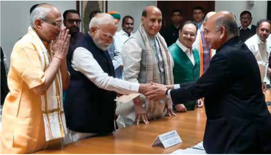
PM Modi flanked by Maharashtra Guv and NDA's VP candidate CP Radhakrishnan, hands over 4 sets of nomination papers to returning officer.

New Delhi: NDA candidate C P Radhakrishnan on Wednesday filed his nomination papers for the vice presidential election in the presence of Prime Minister Narendra Modi, Defence Minister Rajnath Singh, Home Minister Amit Shah and other senior leaders.