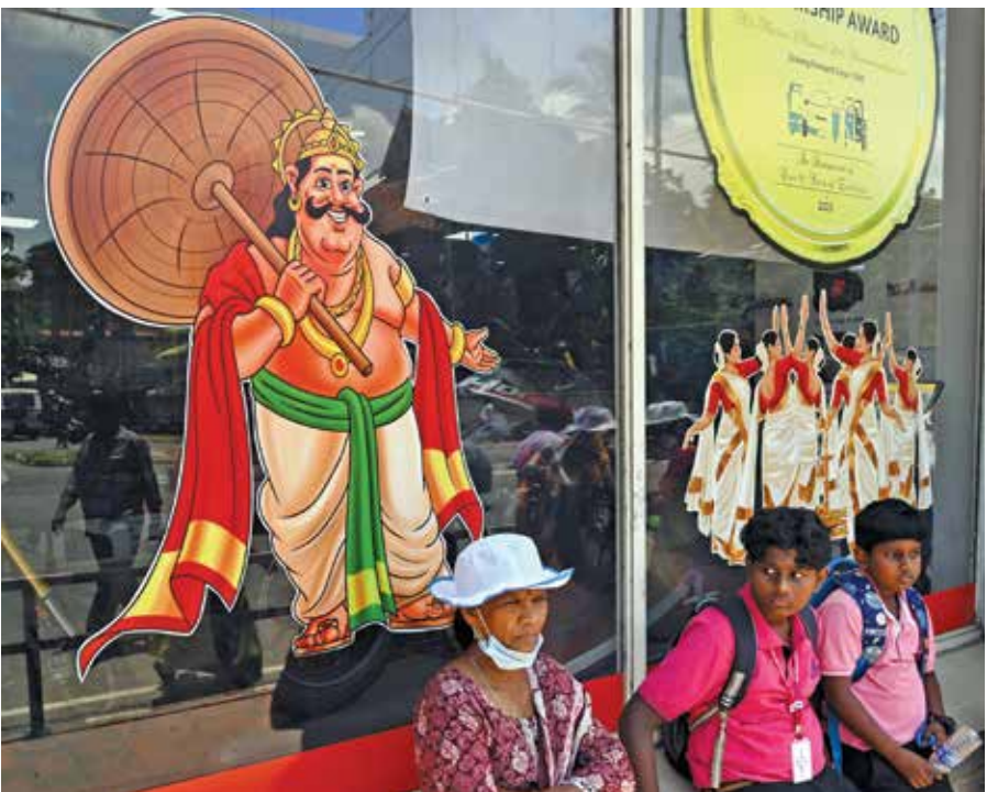
Commuters wait for bus in the backdrop of an illustration of King Mahabali amid preparations for the Onam festival in Thiruvananthapuram on Wednesday.

According to Afghanistan's Deputy Foreign Ministry Spokesman Hafiz Zia Ahmad Takal, the conference will include detailed discussions on various aspects such as strengthening political ties, creating new opportunities for economic co-operation and taking joint measures on regional security. -PTI