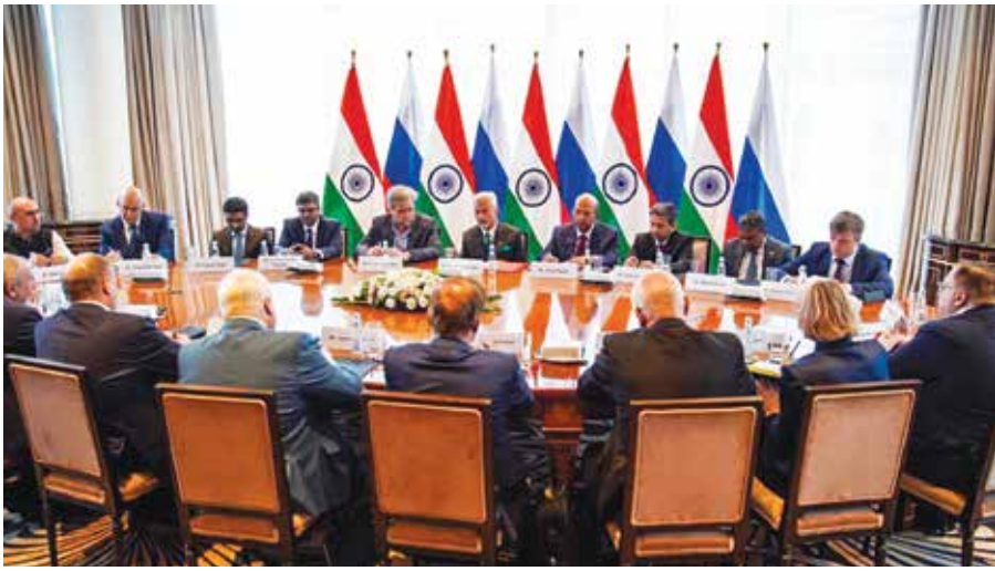
External Affairs Minister S Jaishankar interacts with prominent scholars and think tank representatives of Russia in Moscow on Wednesday.