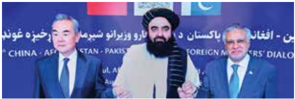
By Sajjad Hussain

Islamabad: The foreign ministers of Pakistan, China and Afghanistan are holding a trilateral meeting on Wednesday in Kabul to enhance cooperation between the three countries and discuss the security situation in the region.