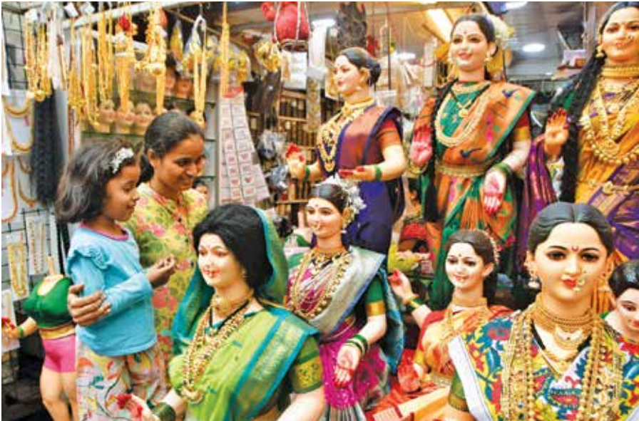
People select the statue of Gauri (Mother of Lord Ganesha) for the upcoming Gauri Ganapati festival at Laibaug Market in Mumbai on Wednesday.

Around 14,000 BEST employees voted in this election. The panel that had their distinct stamp could perform only to a certain extent.