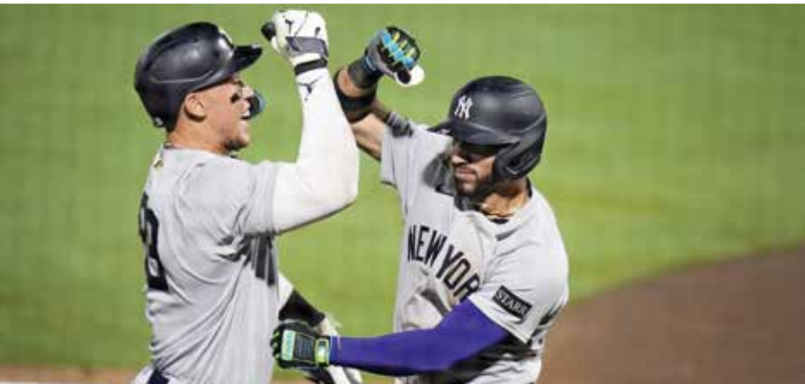
New York Yankees Jose Caballero (right) celebrates his home run with Aaron Judge during a baseball game.

Diamond League champion. Each champion is awarded the iconic Diamond Trophy and a wild card for the World Athletics Championships. The men's javelin event will be held on August 28. The winner of each event will get a trophy and USD 30,000 as prize money. The second place finisher will pocket USD 12,000 and third place-finisher USD 7,000. But this year, winners of eight events out of the 32 will get enhanced prize money. The eight events are 100m men, 1500m men, 400m hurdles men, pole vault men, 100m women, 100m hurdles women, 3000m women and long jump women. In these eight events, the winner will pocket USD 50,000, while the second and third-place finishers will get USD 20,000 and USD 10,000 respectively. -PTI