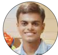
By Prithvi Asthana