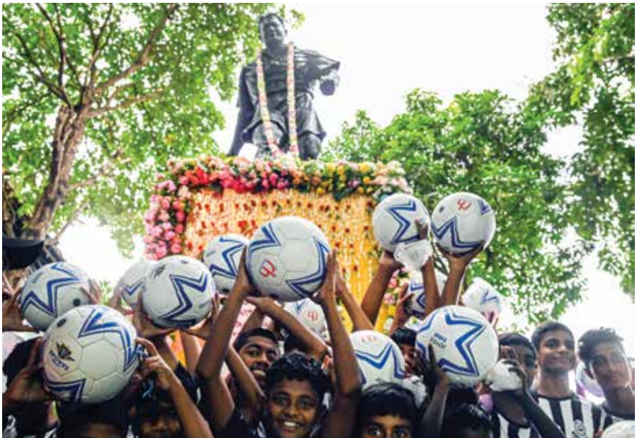
Budding football players celebrate on the occasion of the 129th birth anniversary of legendary footballer Gostha Pal near his statue in Kolkata.