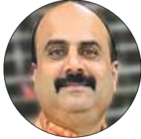
By Amey Chitale