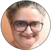
By Smitha Balachandran

In the grand theatre of democracy, the floor of a legislature is often where the spotlight shines brightest. Cameras linger on raucous debates in the U.S. House of Representatives or the Lok Sabha, on fiery exchanges, last-minute walkouts or carefully crafted soundbites that feed the evening news cycle. But the real business of legislating rarely happens there. It takes place in the shadows within the intricate world of committees. In Washington, committees are the machinery that makes the vast and unwieldy American Congress function. Without them, its 535 lawmakers could scarcely cope with the sheer volume of legislative proposals, oversight obligations, and budgetary scrutiny that confront them. These committees, often called ‘little legislatures’ are the places where the meticulous business of lawmaking - questioning, revising, amending and killing bills - happens. India, too, has committees. Its parliamentary system borrows heavily from Westminster, where the committee tradition is centuries old. But in New Delhi, committees often lack bite, their influence diluted by political indifference, procedural fragility, and The committee system is the unsung engine of American lawmaking. India’s version, by contrast, sputters.