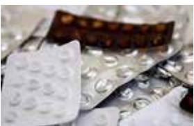
ders as a priority in 2023.

He noted that NITI Aayog had shortlisted 13 disor-