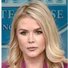
Karoline Leavitt, Press Secretary, White House

“He (Trump) has taken actions, as you’ve seen, sanctions on India and other actions as well. He has made himself very clear that he wants to see this war end. The president wants to move and bring this war to an end as quickly as possible.”