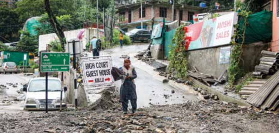
A woman stands amid mud and debris washed along flash floods triggered by cloudburst at Shastri Nagar area in Kullu district in Himachal Pradesh.

However, Tejinder was picked up by Delhi Police in a separate fraud case during the period, making it difficult for the police to advance the investigation.