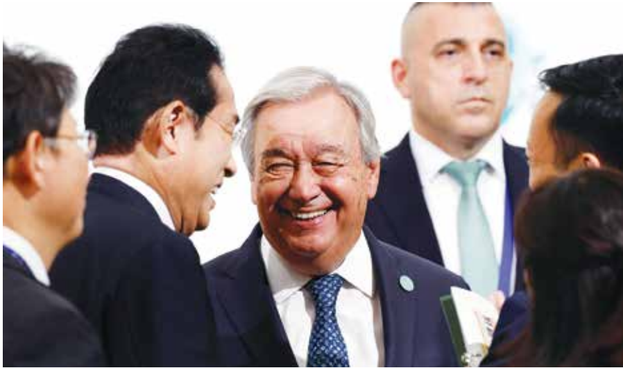
U.N. Secretary-General Antonio Guterres smiles with former Japanese PM Fumio Kishida at the Tokyo International Conference on African Development in Yokohama on Wednesday.