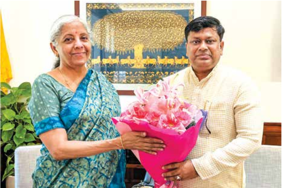
Finance Minister Nirmala Sitharaman with Union Minister of State for Education and Development of North Eastern Region Sukanta Majumdar at Parliament House in New Delhi.

The minister also noted that with China importing goods worth over USD 2 trillion annually, Pakistan should strategically aim to capture at least USD 30-50 billion of this trade by building competitiveness and sectoral readiness, according to Dawn. -PTI