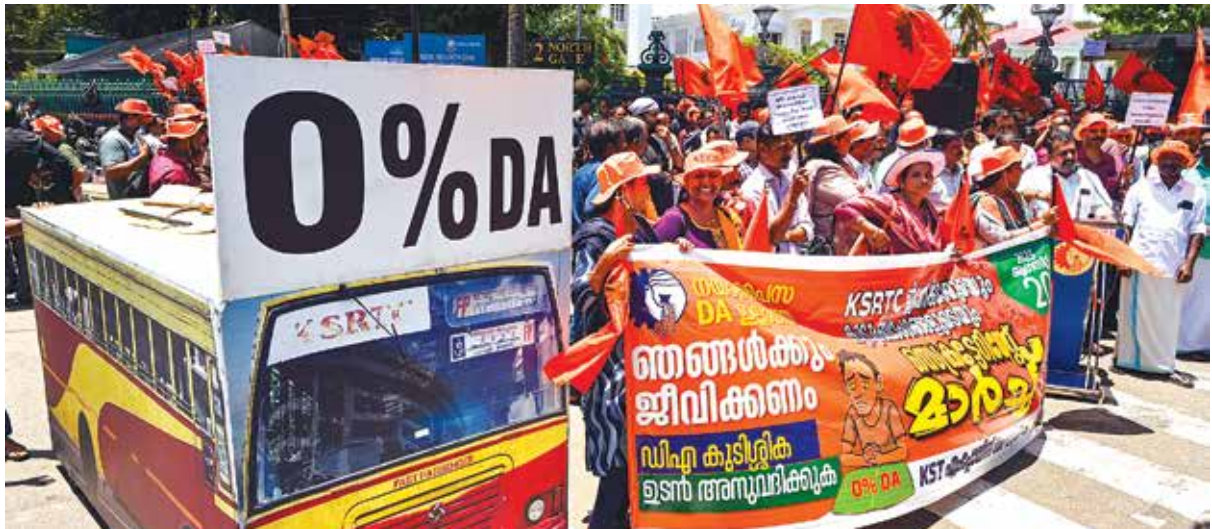
Kerala State Road Transport Corporation employees and their family members, under the BMS union, stage a protest over salary delays in Thiruvananthapuram on Wednesday.

"The data signals a clear imbalance. India is structurally dependent on China, while gaining little market access in return. Without urgent policy intervention, this economic asymmetry will only worsen," he added. -PTI